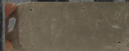
during the proces of getting wet, the concrete absorbes water and zzzthe reflections disappear.