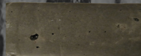
The wet- stage- darker complexion, and hidden reflections.