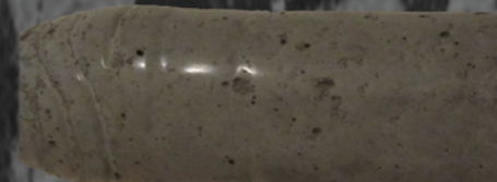
The dry- stage- reflections give the concrete a certain shine.