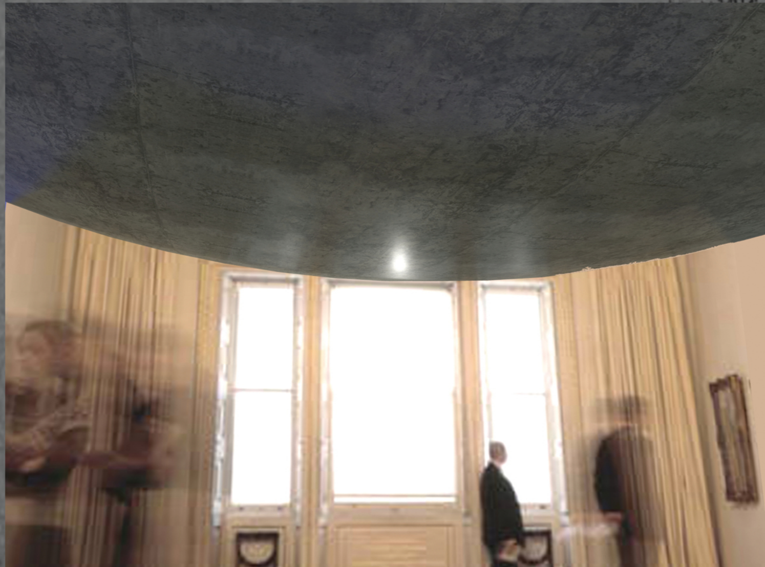
Born out of 2 researches: What is a monolith? and Can versatility create a new use for concrete?