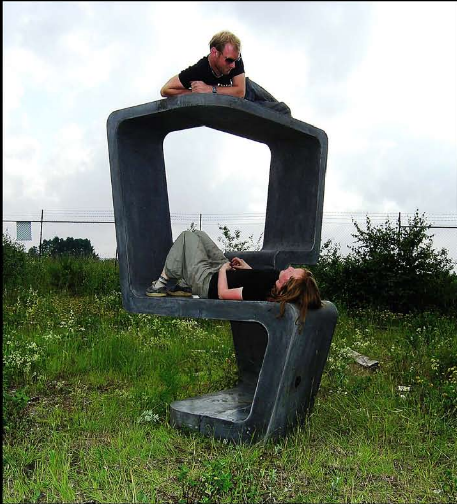
A single surface for multiple uses.