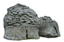
Erratic Natural Indicator in the Landscape