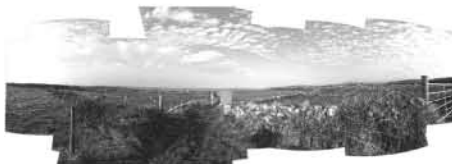
Insertion Indicator in the Landscape

Through in theory the idea is one that could be replicated across the landscape at the innumerable points where paths and roads become dead ends, the site that I was investigating is close to the village of Doelin, located in the townland "Ta gao Eaná", this place became especially important as through the topography of the site a view to the arann islands that opens up at the end of the road.