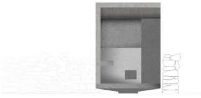
South West Elevation 1:50