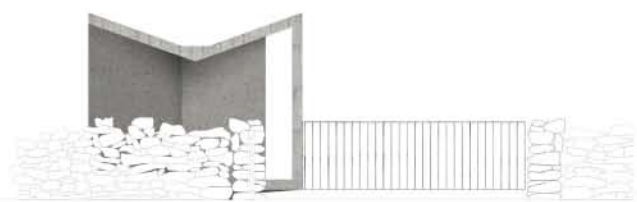
South East Elevation 1:50