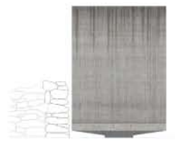
North East Elevation 1:50