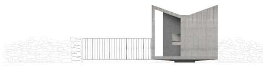
North West Elevation 1:50