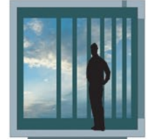
SECTION WEST : EAST