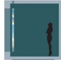
SECTION NORTH : SOUTH