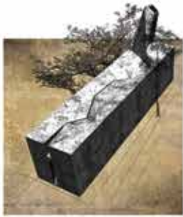
DIMENSIONS | 5m x 20m x 5m

CONCRETE THAT CHANGES SECTION, COLOR (AGGREGATE) AND TEXTURE (FORMWORK) / A CINEMATOGRAPHIC EXPERIENCE OF A CONCRETE CAVE